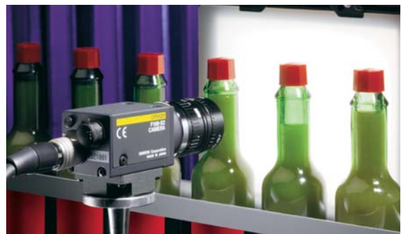
Monitor bottle overfill and underfill

Package fill level tolerances, by law, are very narrow when it comes to permissible underfilling. However, business profitability demands that overfill be kept to a minimum, too. Machine vision systems can check fill level to verify minimum product requirements and alert when overfill results in excessive product giveaway.