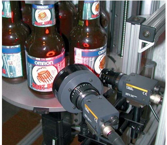
Inspecting date/lot code and label quality

Food & beverage companies invest heavily and consistently in solutions to optimize their manufacturing operations in order to avoid capital equipment investments to increase capacity. Slim profit margins compared to other industries, and increasing quality and variety demands from customers, retailers and regulatory agencies are typical reasons for taking this incremental improvement approach. Each investment gets scrutinized for its impact on ROI and only the strongest and most urgent projects get funded. Many packagers are lowering their waste thresholds in production and improving package quality using today's more focused, more affordable machine vision solutions. These can deliver a boost in ROI and help fund more capital-intensive production upgrades. A goodwill byproduct from improved quality is improved retailer and customer confidence.