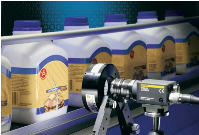
Vision sensor detects torn label

Products with torn, soiled or improperly positioned labels reflect poorly on the brand and bring into question the quality of the contents. The problem magnifies when those packages remain unsold on store shelves. If the label problem affects several cases or pallets, retailers may return them for credit or put the brand on probation. Such situations can negatively influence retailers' decision to promote new products or maintain shelf placement of existing products. Using a vision sensor placed after labeling/before cartoning prevents imperfectly labeled product from getting into the supply chain.